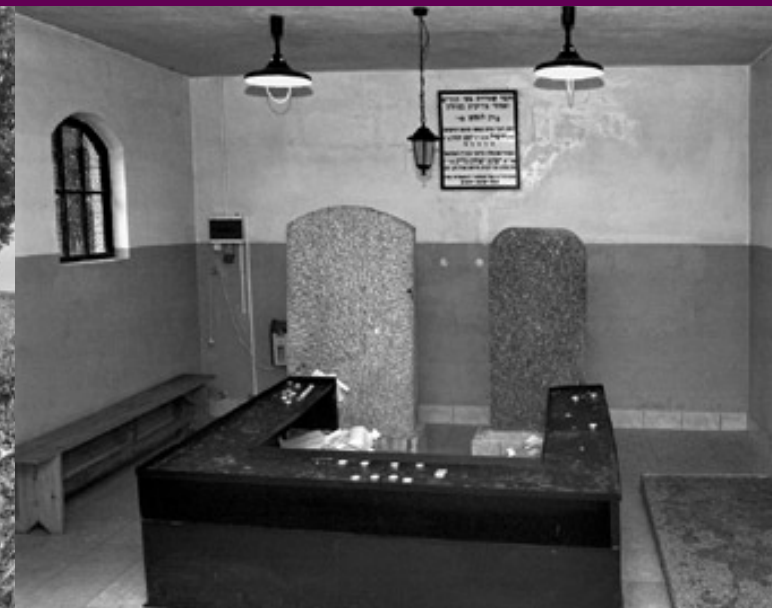
The interior of the ohel

As of 1764, there were 245 Jewish residents in Rymanów. The local kehilla was the third biggest community in the Sanok district, after Lesko and Dynów. The town became one of the most significant commercial centers of the region. The number of Jews in Rymanów rose up to 563 people (which made 41% of the population's total) already before the first partition.