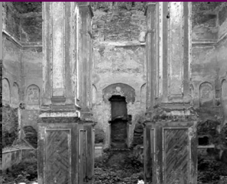
The synagogue's interior before 2005