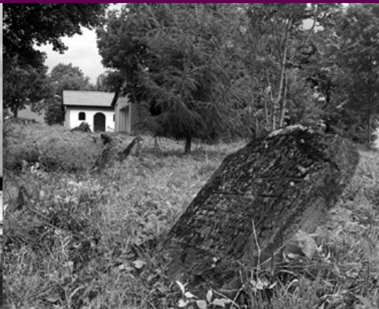
The cemetery with the ohel in the background