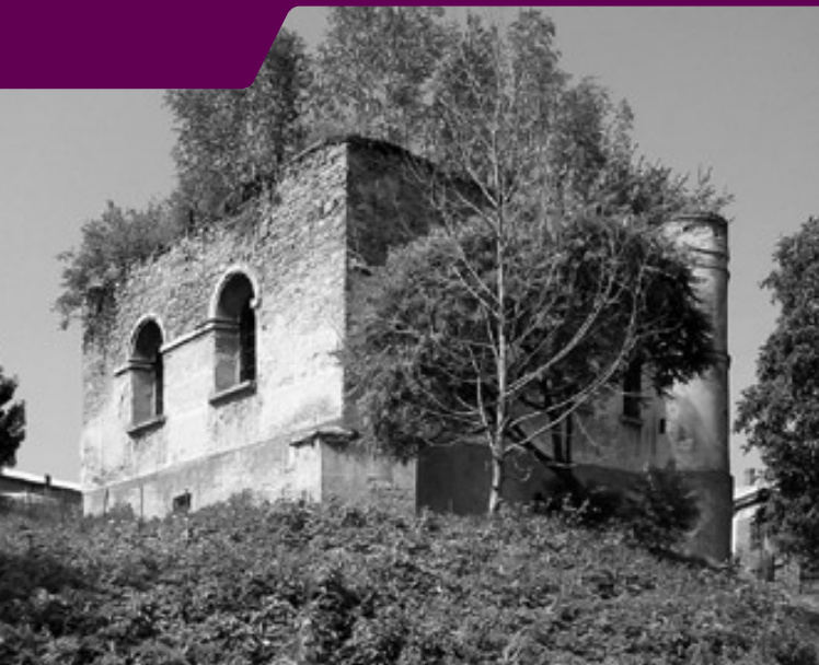
The synagogue's condition before 2005